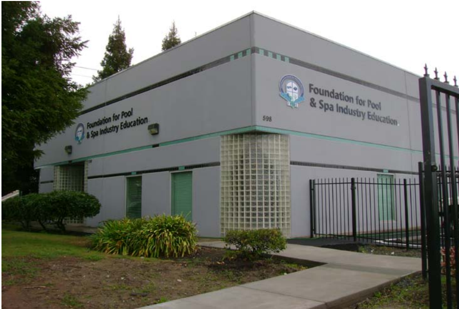
FPSIE Education Center Sacramento, CA