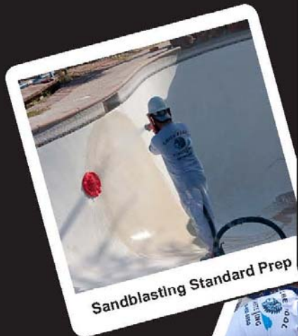
Sandblasting Standard Prep

Specializing in Complete Remodels & New Pools - River Rock Pebble & Diamond Brite Aggregate Finishes -