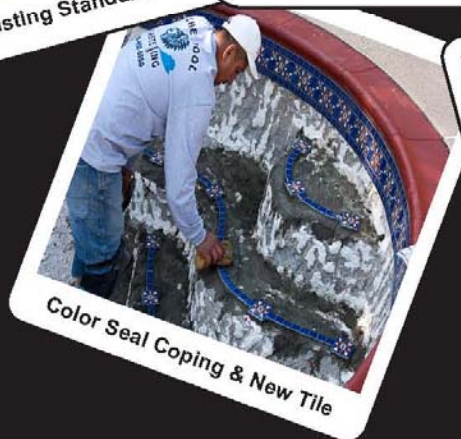
Color Seal Coping & New Tile