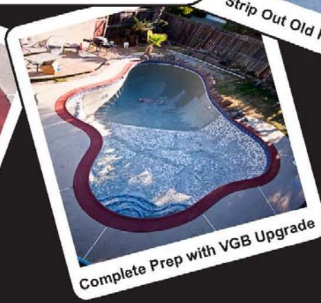
Complete Prep with VGB Upgrade