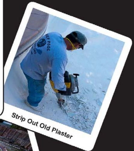
Strip Out Old Plaster