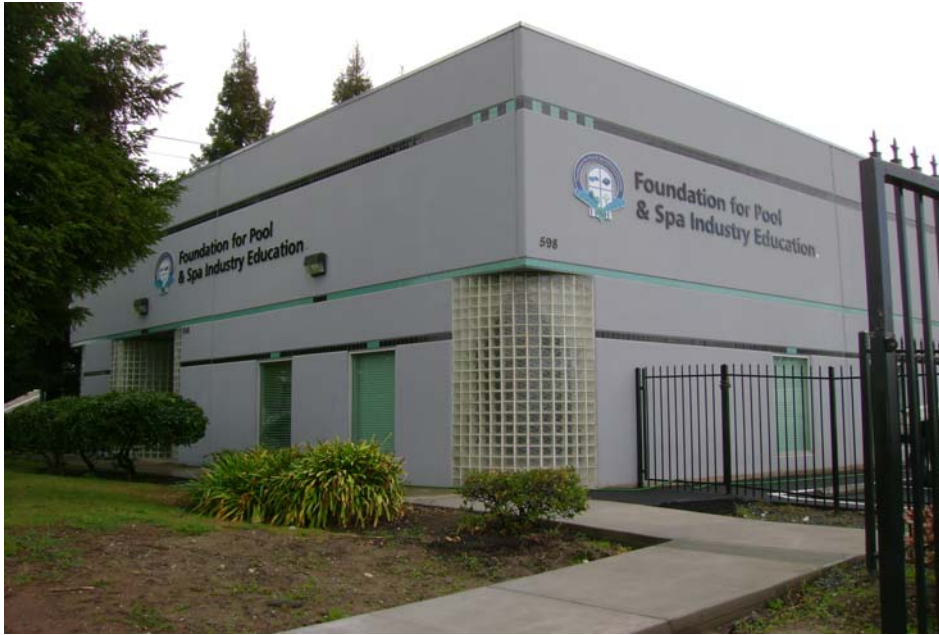
FPSIE Education Center Sacramento, CA

PROJECT OBJECTIVES FOR THE DEBBIE MEYER SWIM SCHOOL POOLS MAKEOVER