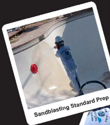
Sandblasting Standard Prep

Specializing in Complete Remodels & New Pools - River Rock Pebble & Diamond Brite Aggregate Finishes -